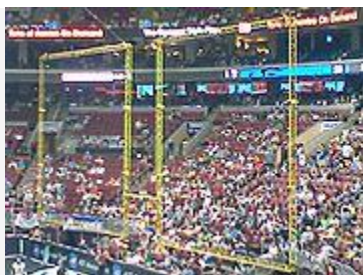
An AFL goalpost